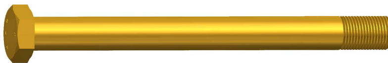
.5X ACTUAL SIZE